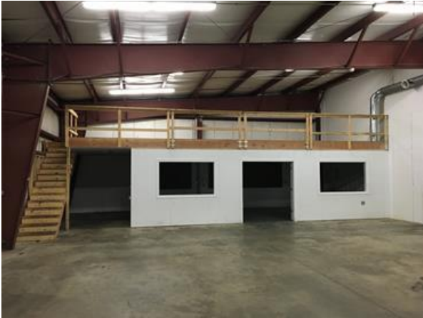
View of Shop & 2 nd Mezzanine