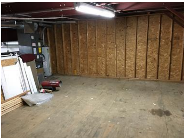
Mezzanine above Office