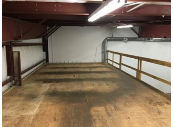
2 nd Mezzanine